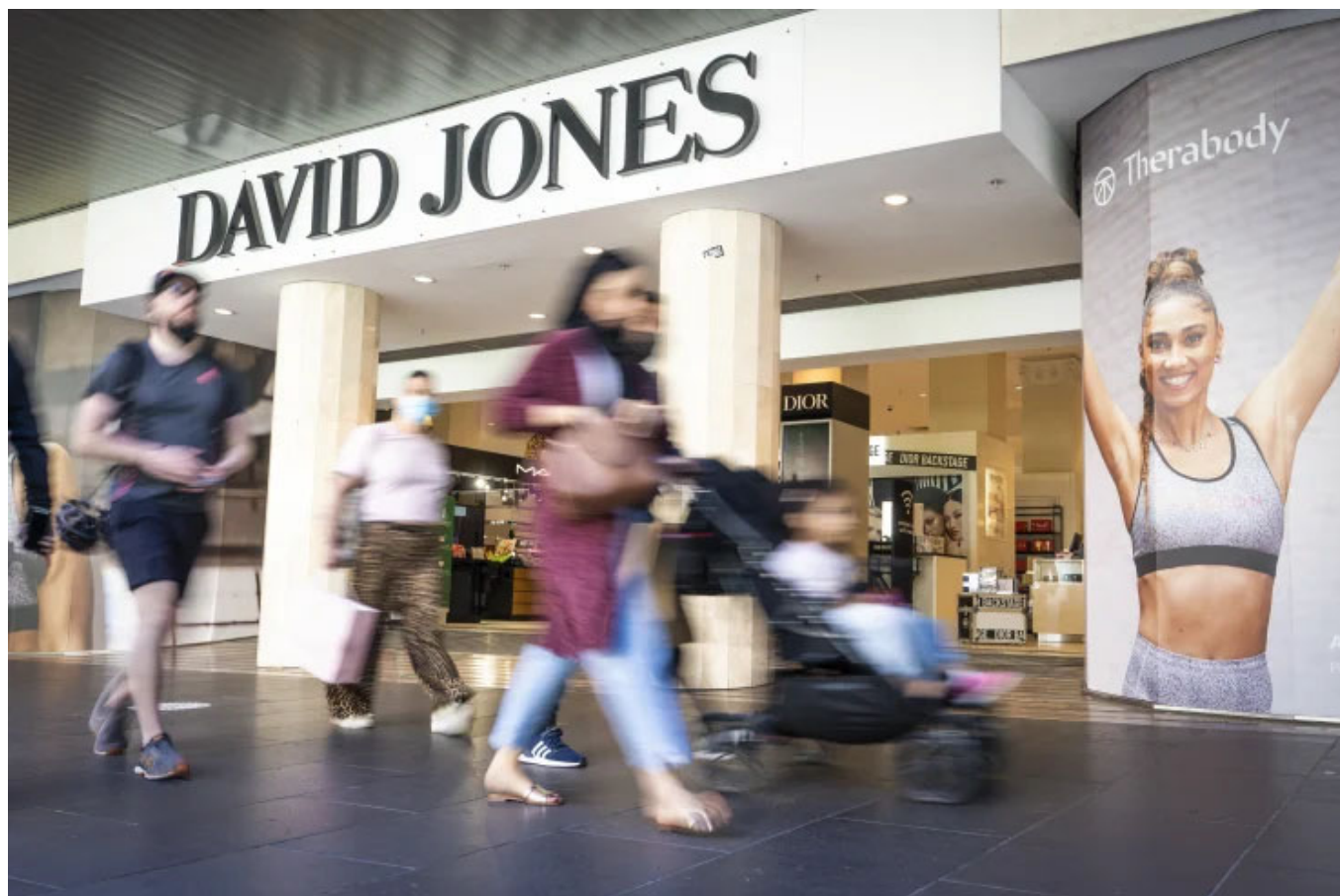
David Jones department store at Bourke Street Mall.

Speculation is mounting that Australian department store David Jones is soon to be offloaded by its South African parent company, and the punters at a soiree to re-launch the chain's Melbourne flagship shop on Wednesday evening were certainly left with that impression.